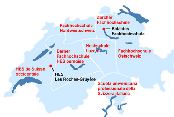
Fig. 2: Network of Swiss universities of applied sciences

At present, there are nine UAS in Switzerland (resulting from the merger of around sixty different colleges). Each UAS is linked either to a single Canton or to an intercantonal agreement according to the map below: